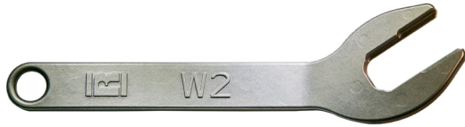
Model W2 (without guard)