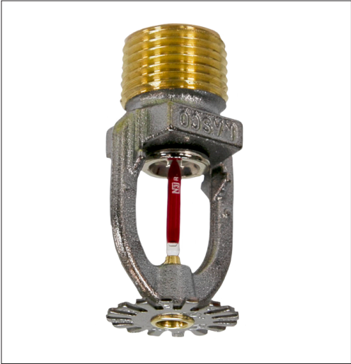
Model F1FR42LL Pendent (Model F1FR56LL Similar)

Important! Reliable fire sprinklers must be handled, stored, and installed in accordance with the guidelines in Caution Sheet 310 and this bulletin. Failure to follow these instructions may result in unintended operation or nonoperation of the fire protection system.