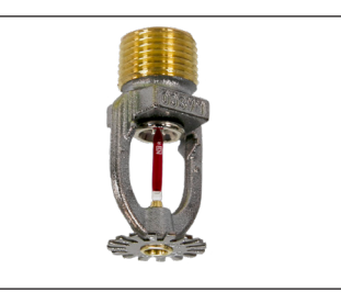
Model F1FR40 Pendent

Important! Reliable fire sprinklers must be handled, stored, and